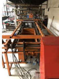
Weld Machine, Bandsaw, Circular Saw Machine, Hydraulic Press, Manuel Lathe, Drilling Machines, Plazma Cutter, Roll Form Machines