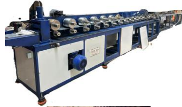
Steel Coil Straightener